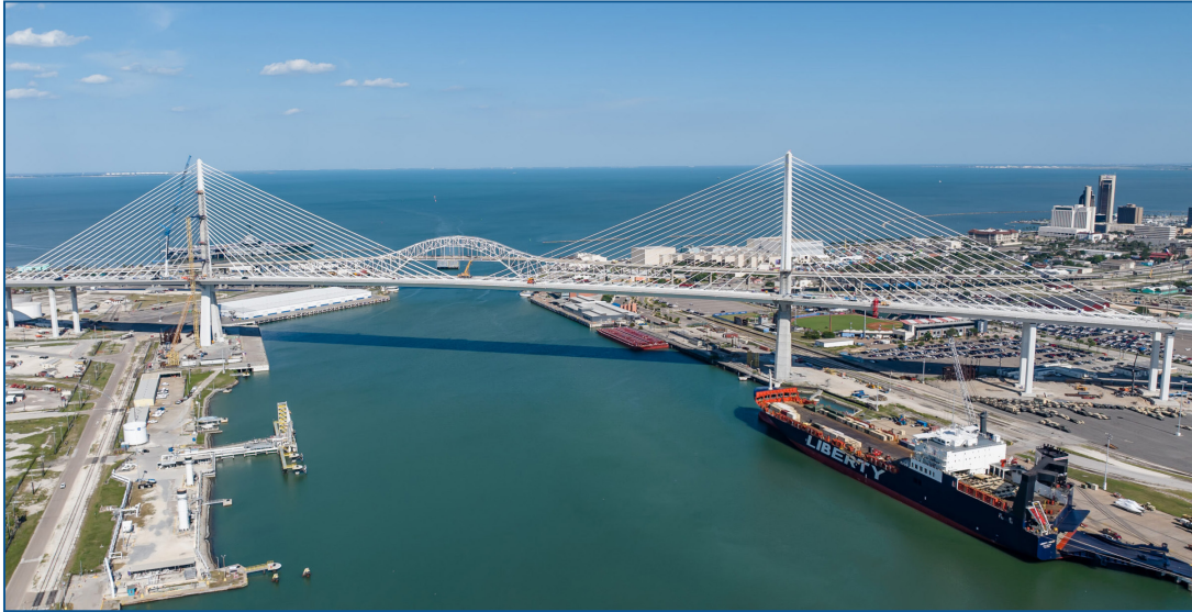
Harbor Bridge Project photo